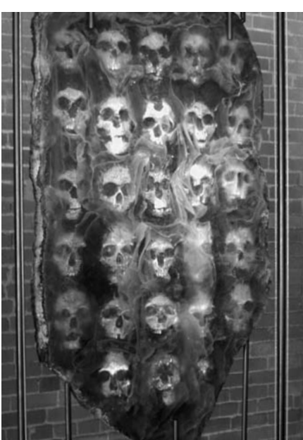
Rafael Cauduro, Tzompantli D, 2002, 100 x 57 x 5 cm

This TipSheet will introduce you to ways to create a reverse relief cast glass object with the optical clarity of a furnace casting using plaster silica design elements in an open face mold assembled from vermiculite board and other refractory materials. In this process there will be less waste than with traditional kilncasting processes and the majority of the mold will be reusable. The molds themselves will be of uniform thickness, allowing for even heating and cooling. Furthermore, the molds will not fail at casting temperature, which is among the most common concerns in kilncasting, and one of the reasons that there is such a boggling array of mold recipes in use. The results are typically much cleaner and more predictable than kilncasting in most of the traditional methods, and