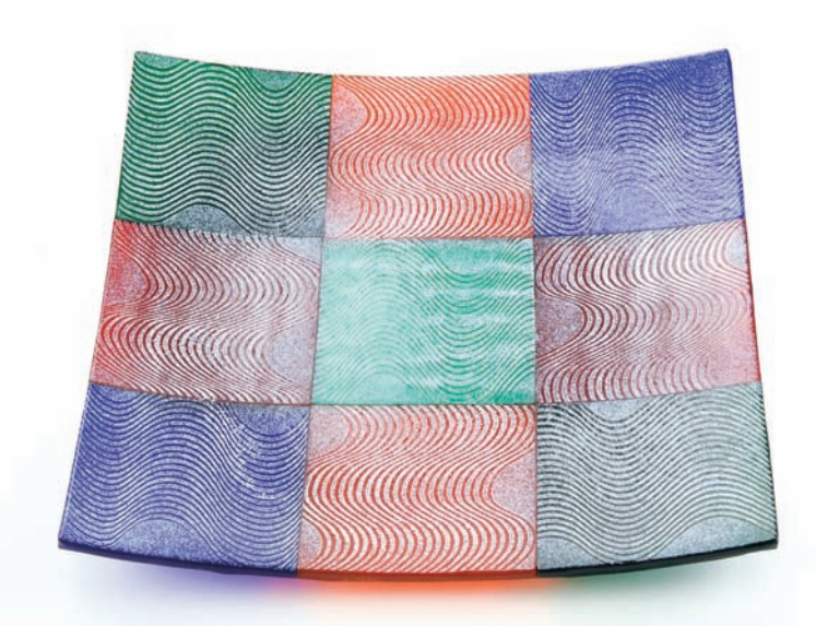
Figure 1: Fused and slumped plate with sgraffito surface, 1.5 \times 9.375 \times 9.375 in (3.8 \times 23.8 \times 23.8 cm).

At Bullseye we call the smaller scale non-sheet forms of our glass "accessory glasses."